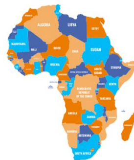
Map of Africa