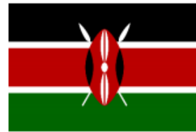
Flag of Kenya