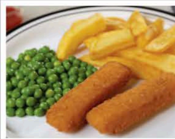
Fish Fingers served with Chips & Peas or Baked Beans