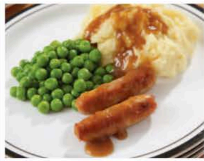
Sausages served with Mashed Potato, Seasonal Vegetables & Gravy