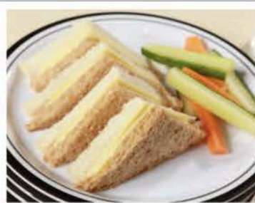
Deli Choice of Breads with a Selection of Fillings served with a Side Salad