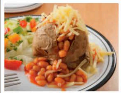
Jacket Potato with a Selection of Fillings served with a Side Salad