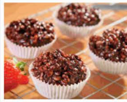
Chocolate Crispy Cake