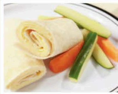
Deli Choice of Breads with a Selection of Fillings served with a Side Salad