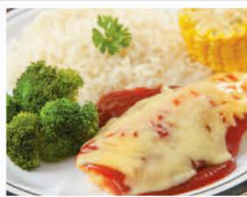
BBQ Chicken served with Savoury Rice and Seasonal Vegetables