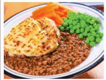
Cottage Pie served with Seasonal Vegetables

VEGETARIAN VERSION OF THE ABOVE AVAILABLE