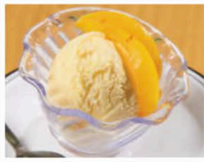
Ice Cream & Fruit