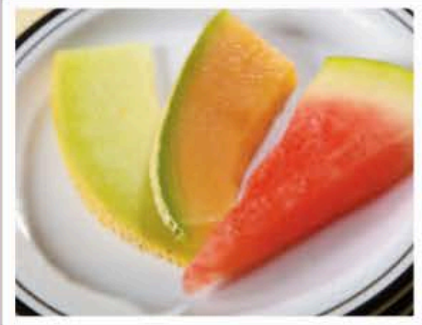
Trio of Melon

AVAILABLE DAILY - UNLIMITED SALAD, FRESHLY BAKED BREAD, FRUIT YOGHURT, FRESH FRUIT PLATTER & CHILLED WATER. FOR ALLERGEN INFORMATION,