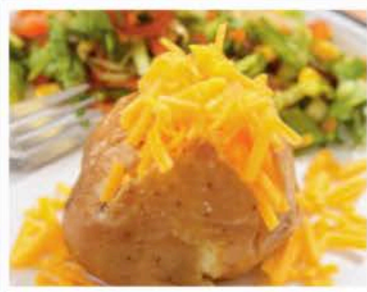
Jacket Potato with a Selection of Fillings served with a Side Salad